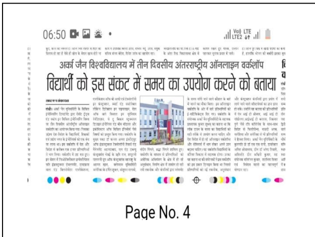
Page No. 4