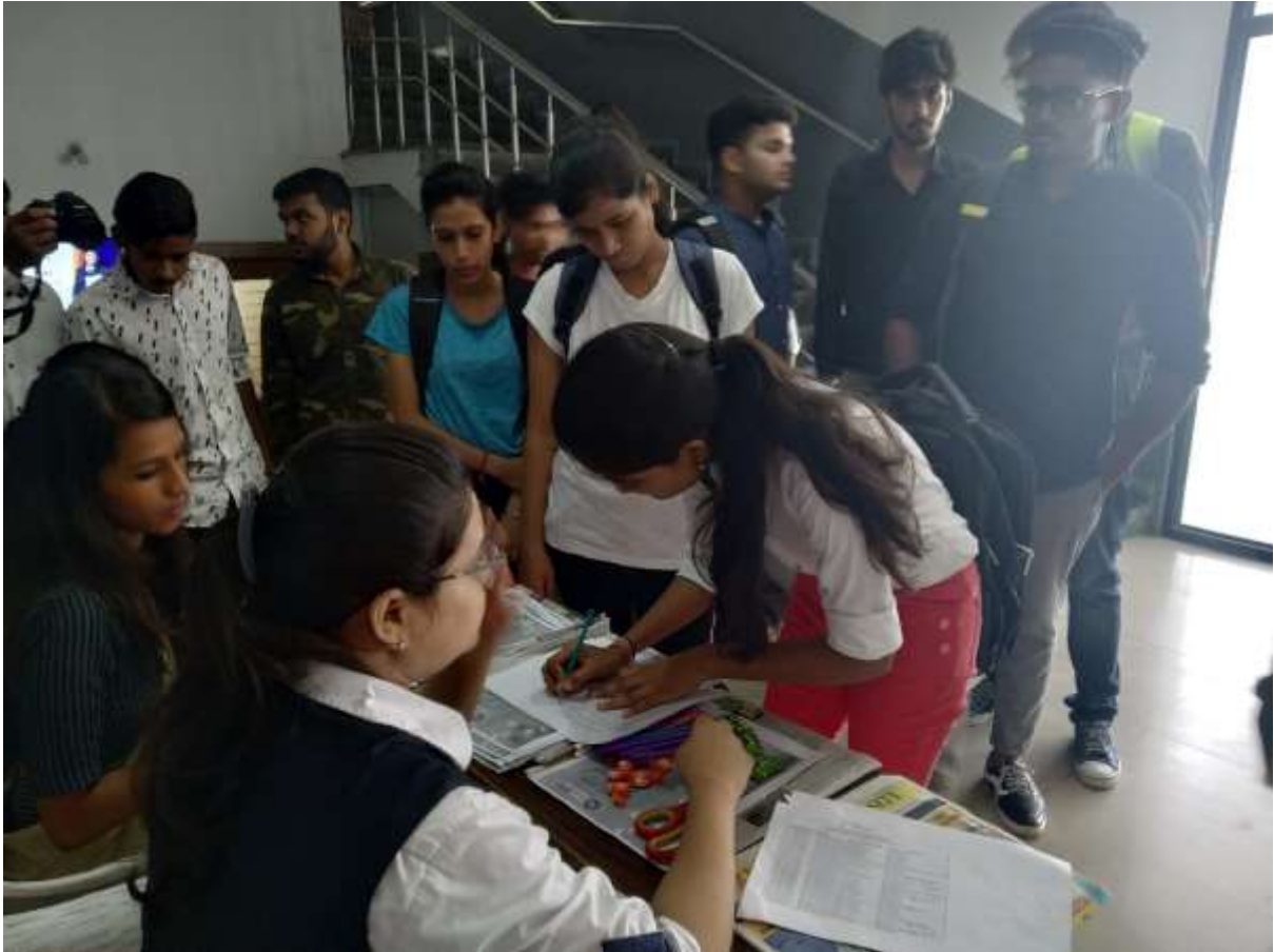
Day 1 – Registrations