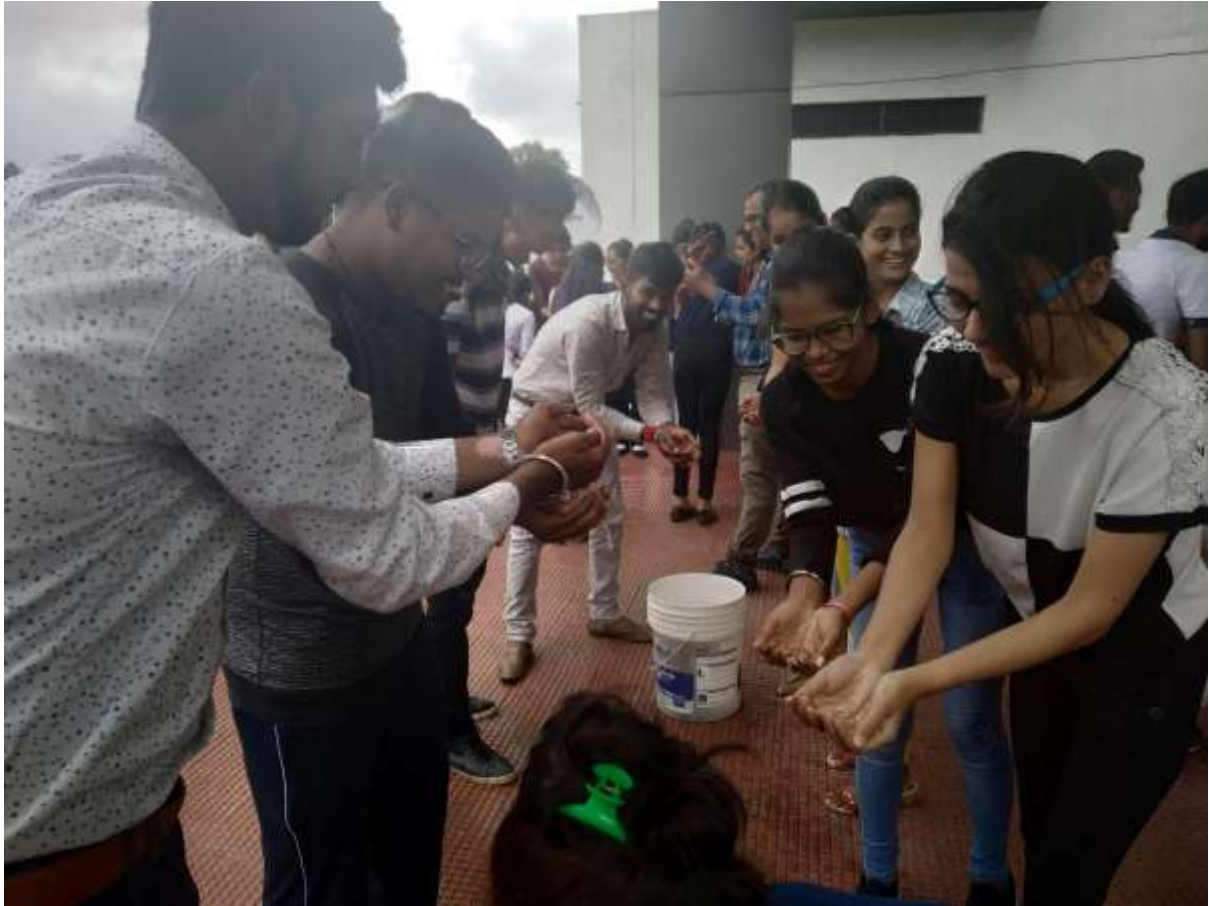
Fun filled – Every Drop Counts