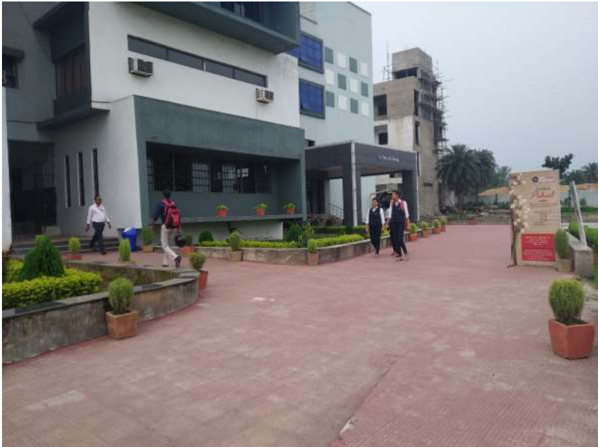
Event Standee at the Entrance

For the next day event – the students were introduced to “Cross Introduction” where they would be introducing not themselves but a peer. They were given the task to interact with each other especially interdepartmentally and prepared for the next day!