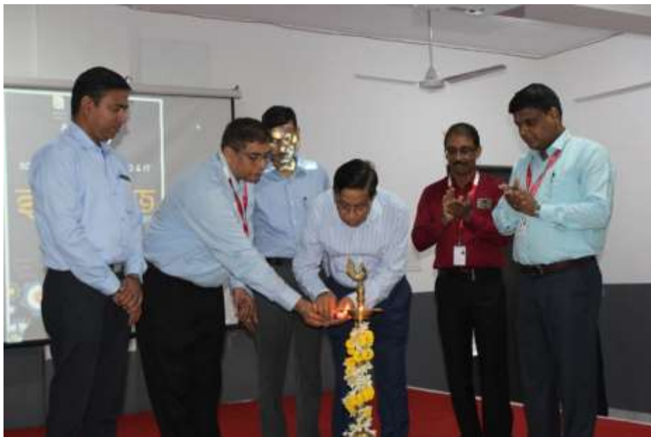
Inaugural Session of Induction Program

A total of 60 students participated in this program which was conducted from 19 th – 23 rd August 2019. Faculty and student volunteers from across programs worked extensively to ensure that the induction was well organized. The following report includes the schedule and brief notes on the various events conducted as part of the induction program.