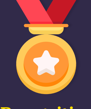
Recognitions & Approvals

ARKA JAIN University, the 1st Private University of Jharkhand (Kolhan Region) established by the JHARKHAND State Legislature under "The ARKA JAIN University Act", recognized by UGC and is an example of excellence. The University situated 13 kms from steel city, Jamshedpur at Gamharia offers multi-disciplinary programs designed in a way to shape the brilliant minds of today into socially-conscious managers, leaders and entrepreneurs of tomorrow. The use of highest-quality research-led teaching and learning methods help students evolve and be ready for the requirements of the industry because we believe – You're one of a kind, So are WE.